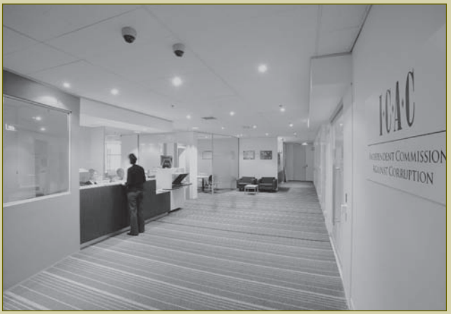
The ICAC in 1989 (left) and today (right).