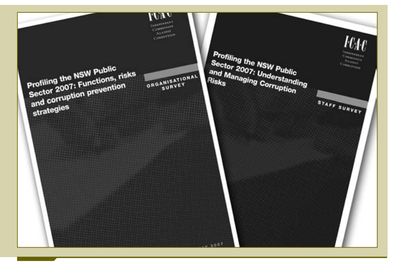
The 2007 organisational and staff surveys

Employees, by contrast, were most commonly concerned about misconduct such as favouritism and harassment. Many staff also identified misconduct involving inadequate advertising (e.g. of tenders or positions),