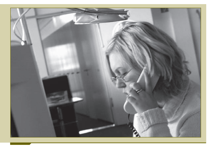
It's better to prevent corruption than cure it.

One of the key functions of the ICAC is to provide advice to the public sector about strategies to minimise corruption and maintain the integrity of public administration. In some situations the ICAC can also provide advice to private citizens about corruption